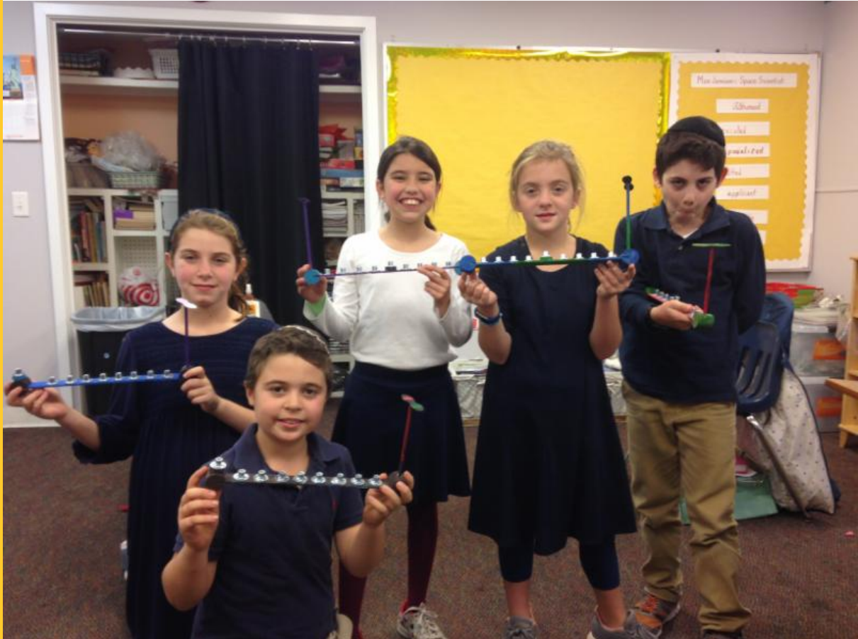
SEVENTH GRADE YAHADUS