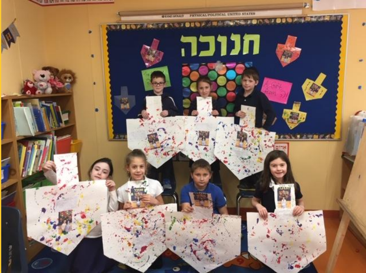
4th Grade Menorahs