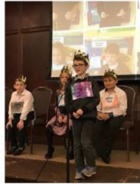
Using our new Siddur!!