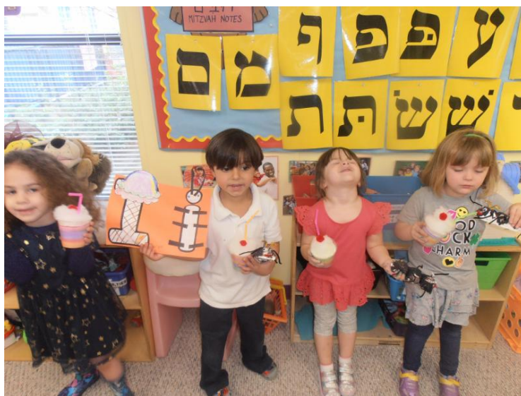
100th day of school!