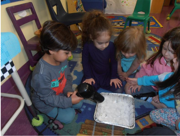
For the letter "I" we made Ice cream and Insects.