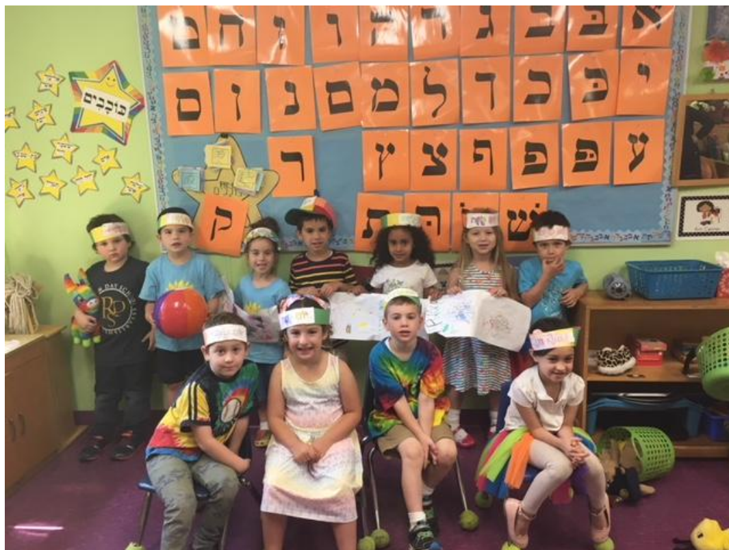
Elementary Lag B'omer Fun