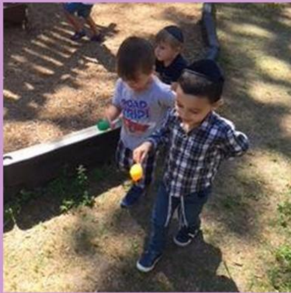
Mother's Day activity with the Moms!