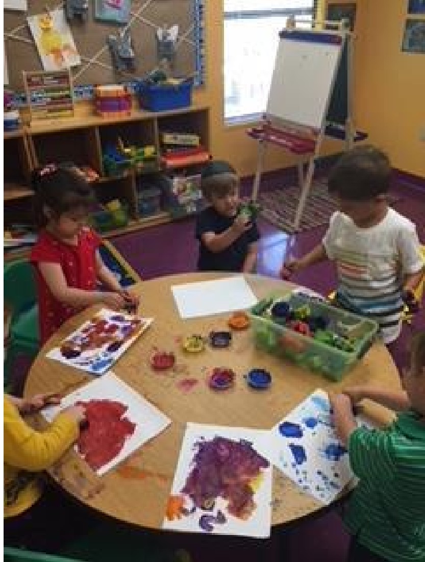
3y made cactuses for the letter C.